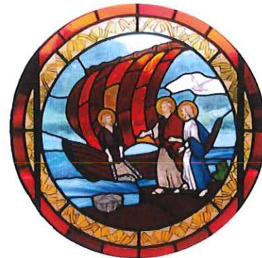
Saint Andrew introduces Jesus to Saint Peter